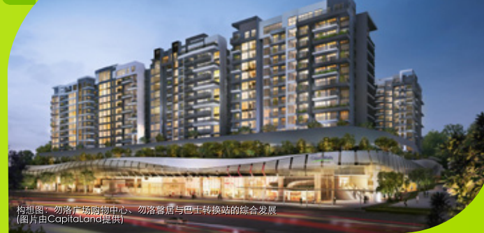
构想图: 勿洛广场购物中心、勿洛馨居与巴士转换站的综合发展