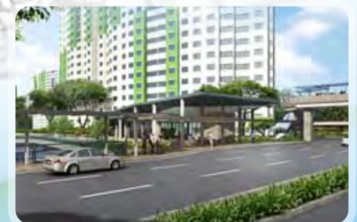
Bedok Reservoir Station - Along Bedok North Ave 3