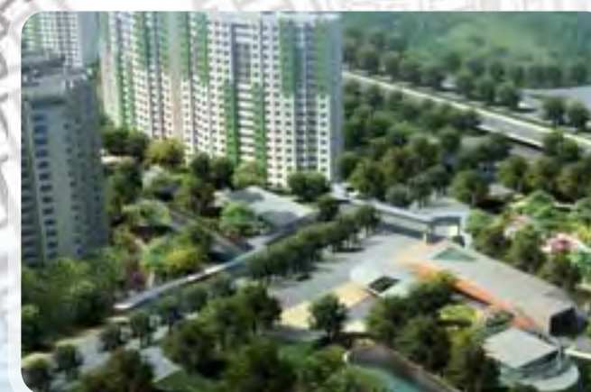
Bedok Reservoir Station - Aerial View