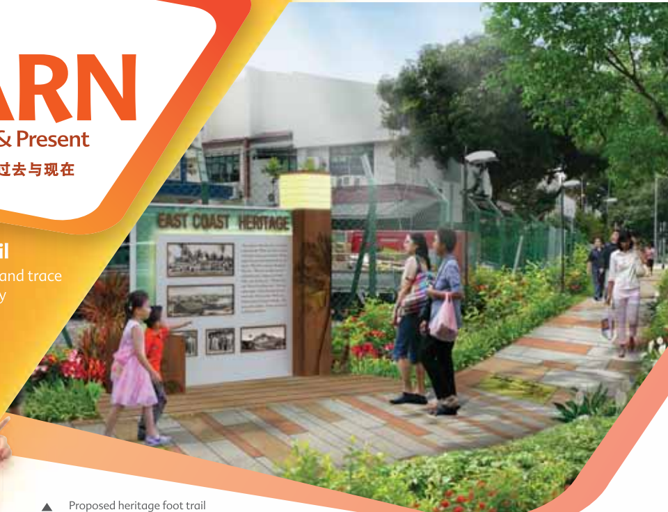
▲ Proposed heritage foot trail along Upper East Coast Road 樟宜路上段拟议中的文化遗产走道