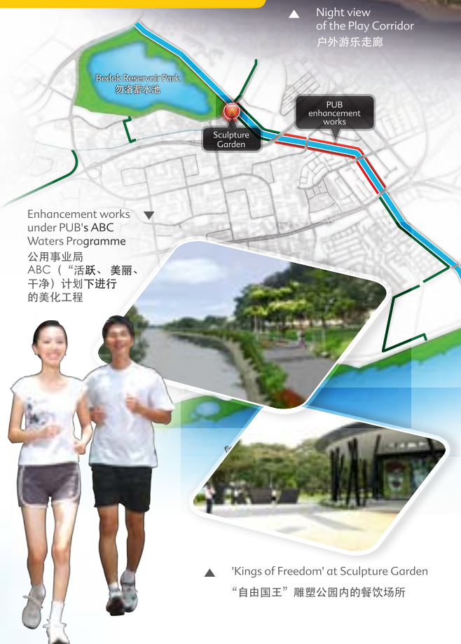
Night view of the Play Corridor 户外游乐走廊