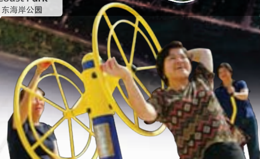
East Coast Park 东海岸公园