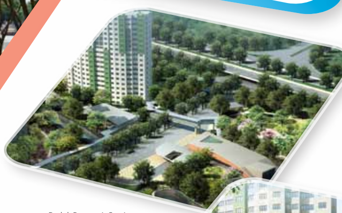
▲ Bedok Reservoir Station 勿洛蓄水池站