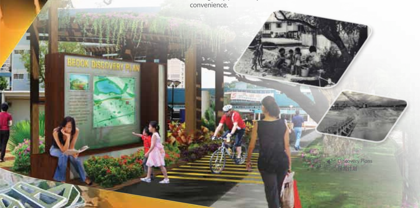
◀ Discovery Plans 探索计划