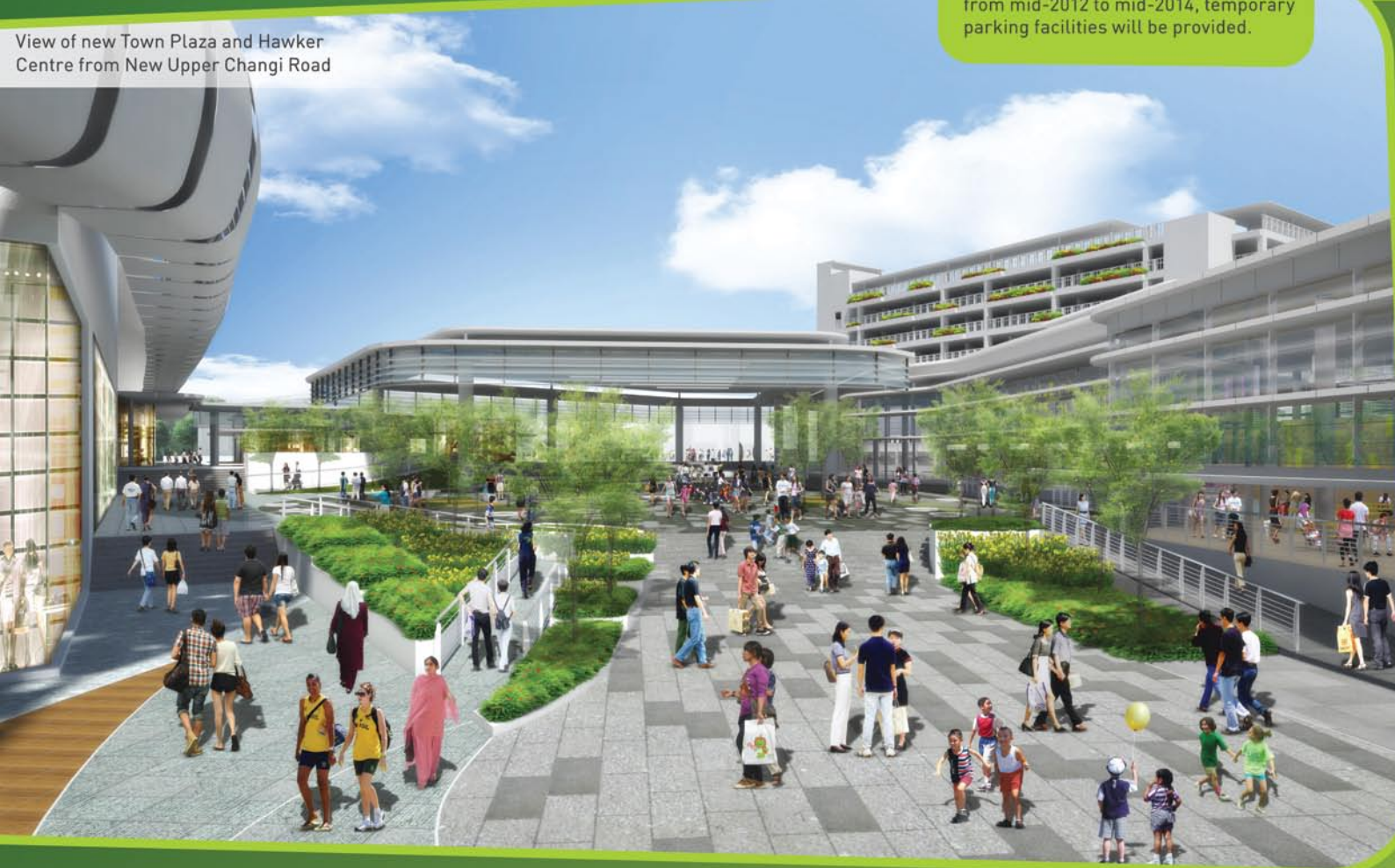
View of new Town Plaza and Hawker Centre from New Upper Changi Road