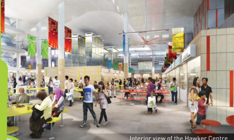
Interior view of the Hawker Centre

During the construction of the MSCP, from mid-2012 to mid-2014, temporary parking facilities will be provided.