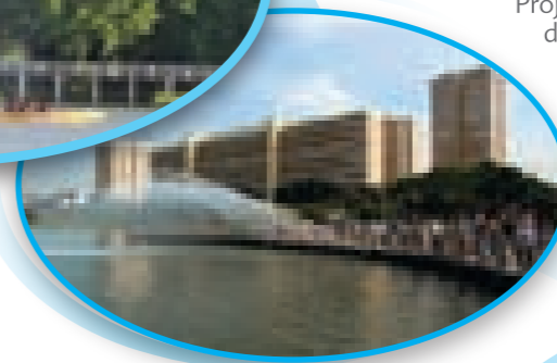
▲ Pandan Reservoir Kolam Air Pandan

Satu pusat baru yang sibuk untuk penggemar sukan air, dengan pelbagai kemudahan untuk sukan memancing dan kawalan radio dan bot layar elektrik.