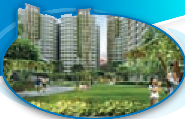
▲ New Housing - Boon Lay Meadow Tapak untuk Perumahan Baru - Boon Lay Meadow