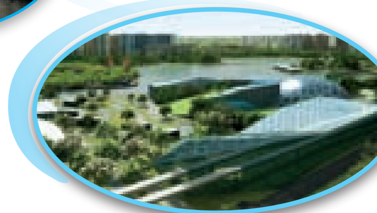
▲ New attractions Daya tarikan baru

Akan ada daya tarikan baru seperti hotel-hotel tepian air, pelantar laluan, tanah-tanah basah, taman-taman dan sesiaran.