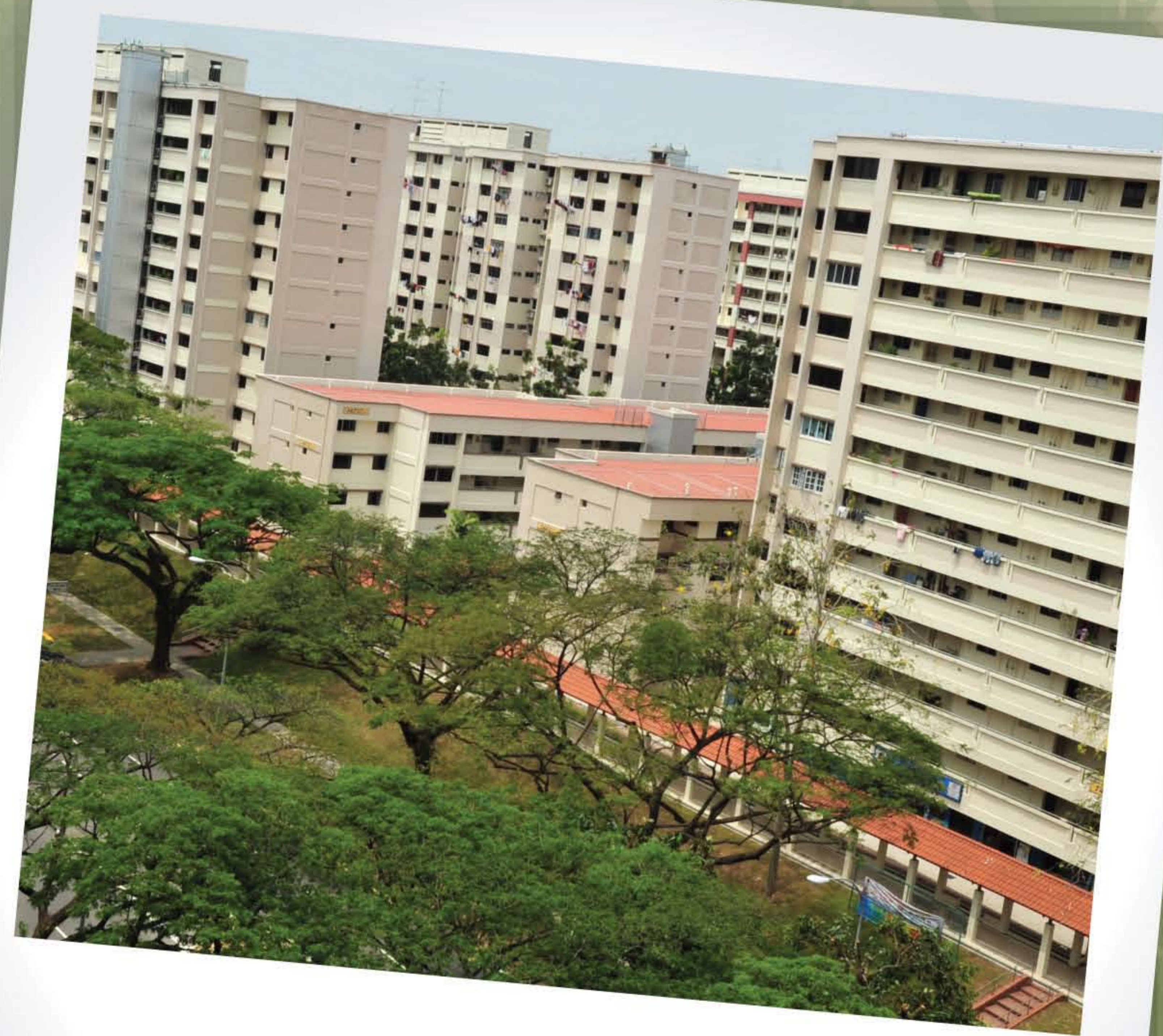
Yishun Neighbourhood 1