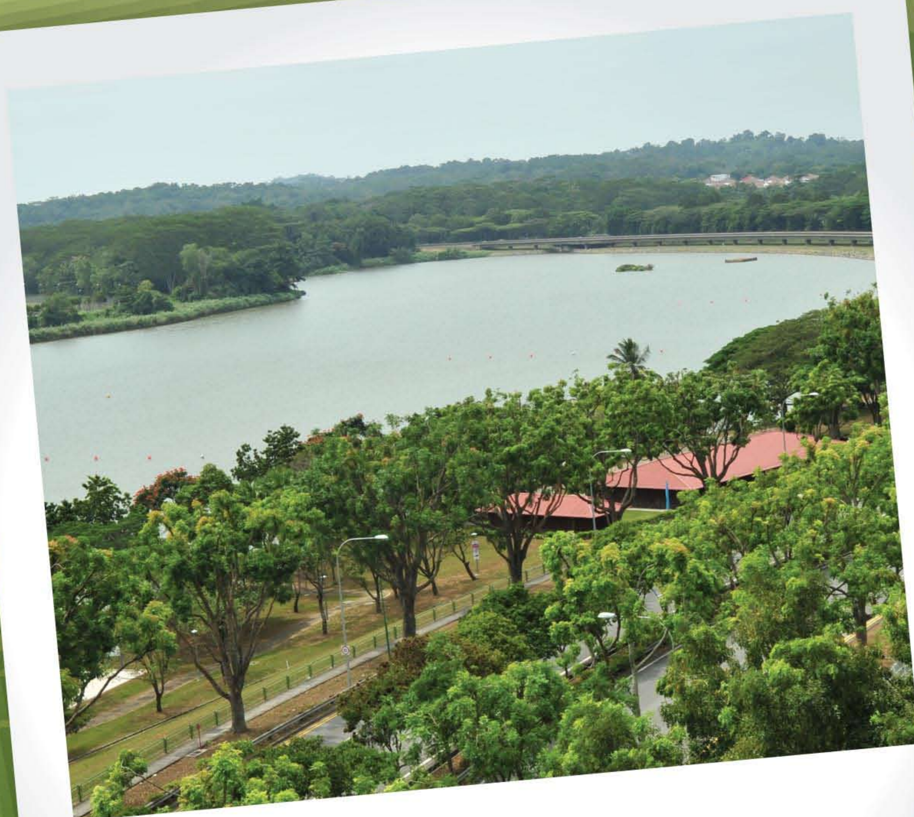
Lower Seletar Reservoir