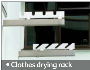
• Clothes drying rack