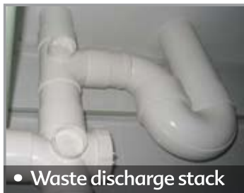
• Waste discharge stack