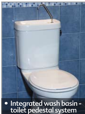
• Integrated wash basin - toilet pedestal system