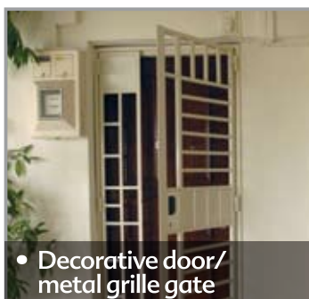
• Decorative door/ metal grille gate