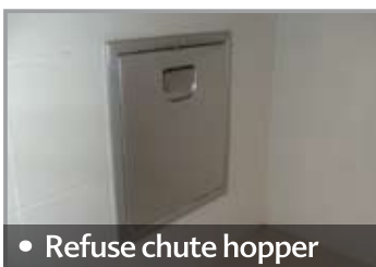
• Refuse chute hopper